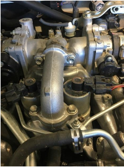
1, Remove Intercooler