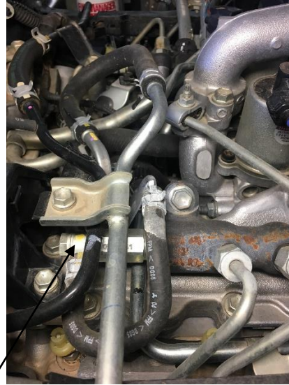
2, Locate FPRV on the end of LH Fuel Rail and remove from fuel rail.