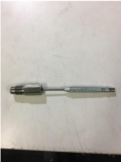
3, Using a 3mm Pin Punch, insert pin punch into back of FPRV and very gently hammer the seat out of the FPR Body.